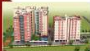
AGRIM RESIDENCY (Guwahati)