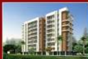
AGRIM VIEW (Dowarah)