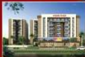
AGRIM AAWAS (BORDIGHAON)