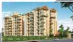
PRIME PARADISE (Hojai)